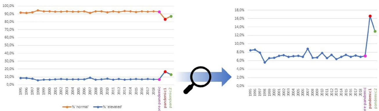
Fig. 2 Yearly proportions of children with normal and elevated internalizing problems based on parent reports in the NTR cohort (general population) since 1995 until 2019, first pandemic measurement (Apr–

A For the pre-pandemic parent reports in the DREAMS sample the informant is unknown, therefore we excluded children with a score of 3, as they could not be categorized properly, see Table S1 for rated dependent cut-off details; remaining N = 1257