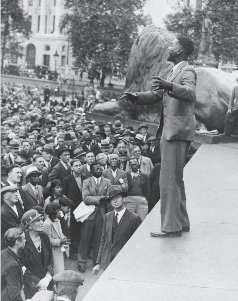
C. L. R. James in Trafalgar Square (1935).