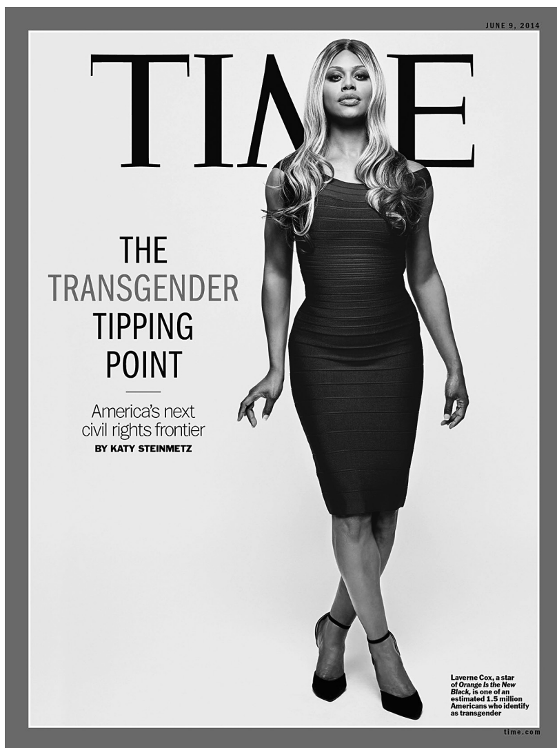
FIGURE 1.1. Time magazine's "The Transgender Tipping Point" cover issue (June 9, 2014).