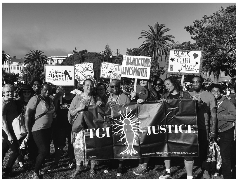
FIGURE 1.6. TGI Justice family, San Francisco Trans March (June 23, 2017).

tween “good” immigrants viewed as deserving pathways to full citizenship and “bad” immigrants seen as acceptable targets of immigration policing. Using the model of the united “familia,” they build alliances within and outside Latinx communities to make the criminalization and abuse faced by undocumented Latinx trans women and trans and queer liberation issues that are integral to immigrant and racial justice movements.