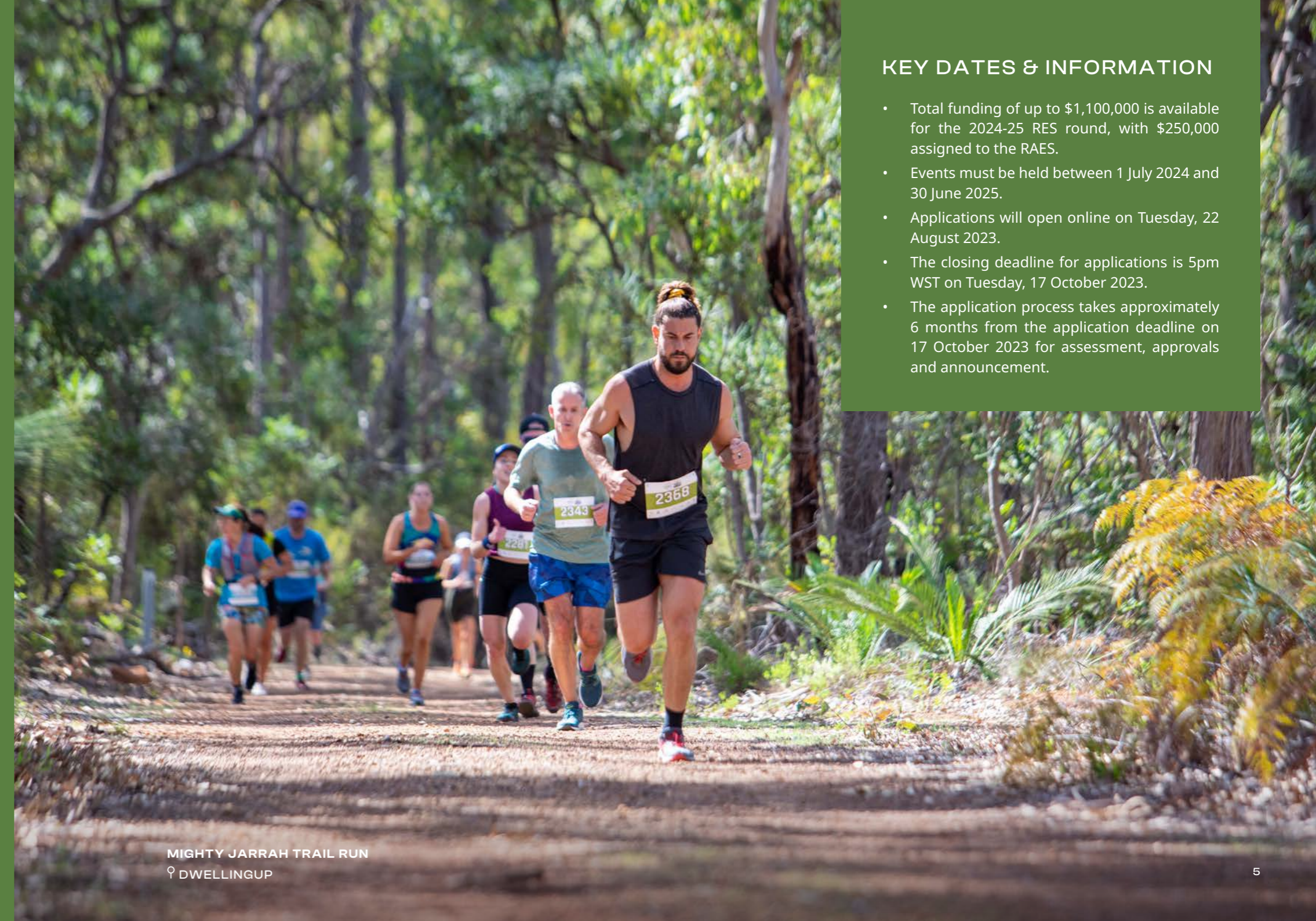
MIGHTY JARRAH TRAIL RUN ♀ DWELLINGUP