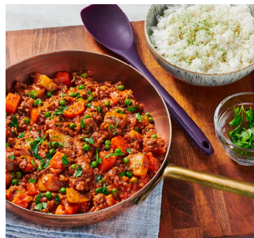
PICADILLO CA / US