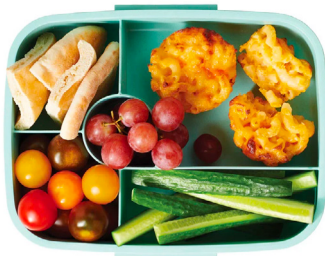
BAKED MAC & CHEESE BITES CA / US

We've got you covered—check out these great recipes and start cooking!