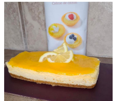
LEMON STEAMER CHEESECAKE CA / US