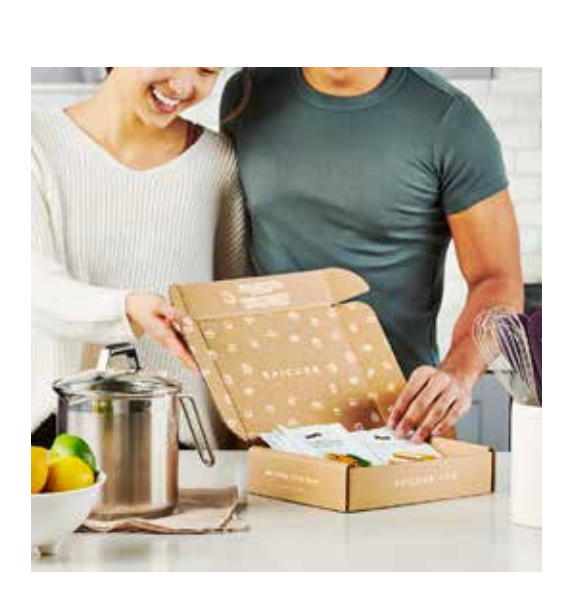
FLEXIBLE PLANS $35 CA | $32 US monthly

Go from raw-to-ready in 20 minutes or less.