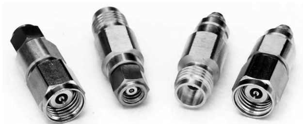
Agilent 11922A/B/C/D Adapters