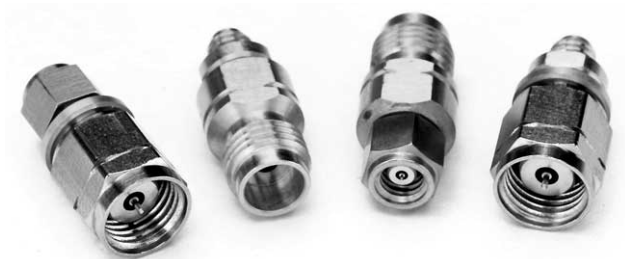
Agilent 11921E/F/G/H Adapters