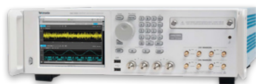
Tektronix AWG70002B | Arbitrary Waveform Generator; 2 Channel at 25 GSa/s