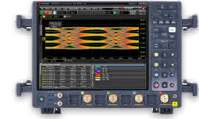
Keysight UXR0254AP | Infiniium UXR Real-Time Oscilloscope; 4 Channels, 25 GHz