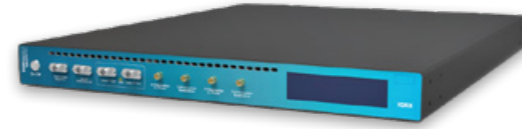
Quantifi Photonics IQRX-1005-FA-EPIQ | High Performance Coherent Optical Receiver