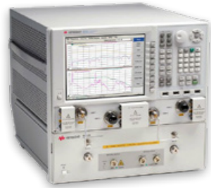
Keysight N4375D | Lightwave Component Analyzer; Single-Mode, 26.5 GHz