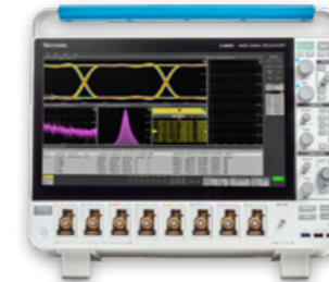
Tektronix MSO68B | Mixed Signal Oscilloscope; 8 Channel to 10 GHz