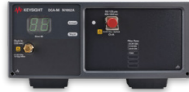
Keysight N1092A | Single Channel Oscilloscope, DCA-M; 45 GHz