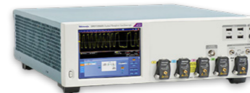
Tektronix DPS75004SX | AT1 Performance Oscilloscope System, 33/50 GHz