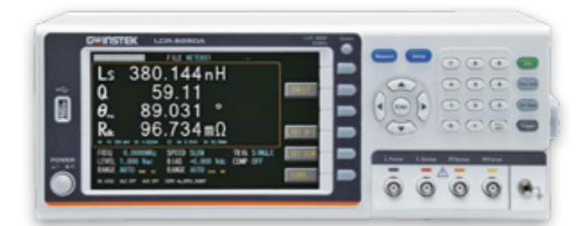
GW Instek LCR-8210 | High-Frequency LCR Meter; 10 Hz to 10 MHz