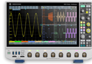
Rohde & Schwarz MX058 | Digital Oscilloscope; 8 Channels