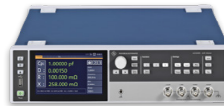
Rohde & Schwarz LCX200 | SLCR Meter, 4 Hz to 500 kHz