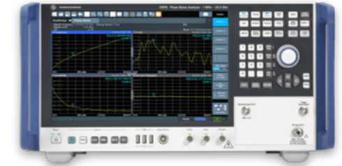
Rohde & Schwarz FSWP26 | Phase Noise Analyzer; 1 MHz to 26.5 GHz