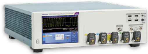
Tektronix DPS75904SX | AT1 Performance Oscilloscope System, 33/50 GHz