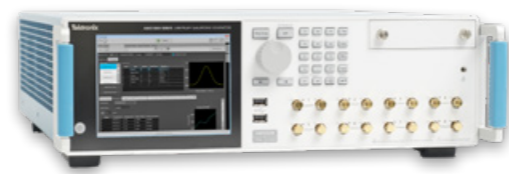
Tektronix AWG5208 | Arbitrary Waveform Generator; 8 Channel, 4 GHz