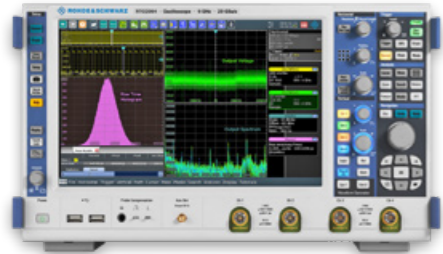
Rohde & Schwarz RTO2064 | Digital Oscilloscope; 4 Channels, 6 GHz