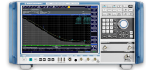
Rohde & Schwarz FSPN26 | Phase Noise Analyzer and VCO Tester; 1 MHz to 26.5 GHz