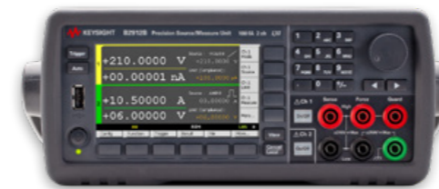
Keysight B2912B | Precision Source Measure Unit, 2-Channel