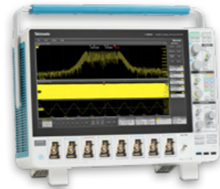
Tektronix MSO58B | Mixed Signal Oscilloscope; 8-Channel