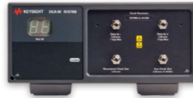
Keysight N1076B | Electrical Clock Recovery Module