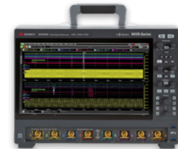
Keysight MXR608B | Infiniium MXR-Series Real-Time Oscilloscope; 8 Channels, to 6 GHz