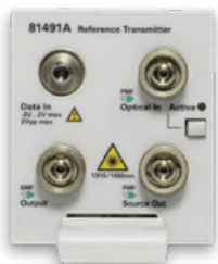
Keysight 81491A | Reference Transmitter