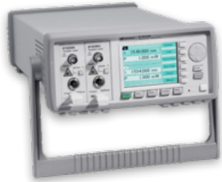
Keysight 8163B | Lightwave Multimeter Mainframe