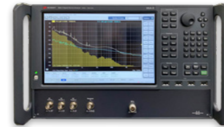
Keysight E5055A | SSA-X Signal Source Analyzer, 10 MHz to 8 GHz