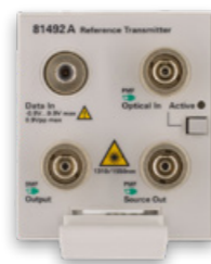
Keysight 81492A | Reference Transmitter