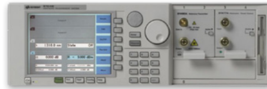
Keysight 8164B | Lightwave Measurement System Mainframe