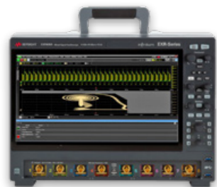
Keysight EXR608A | Infiniium EXR-Series Real-Time Oscilloscope; 8 Channels, to 6 GHz