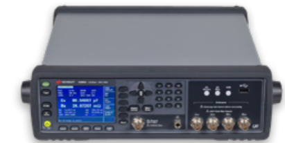
Keysight E4980A | Precision LCR Meter; 20 Hz to 2 MHz