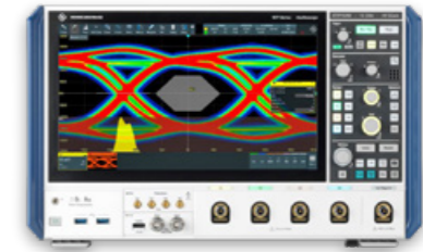
Rohde & Schwarz RTP164 | High Performance Digital Oscilloscope; 4 Channel, 16 GHz