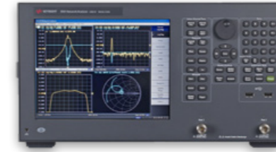
Keysight E5061B | ENA Series Network Analyzer/Impedance Analyzer, 100 kHz to 3 GHz