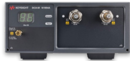
Keysight N1094A | Dual Channel Oscilloscope, DCA-M; 50 GHz