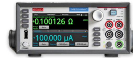
Keithley 2450 | Graphical Digitizing SourceMeter