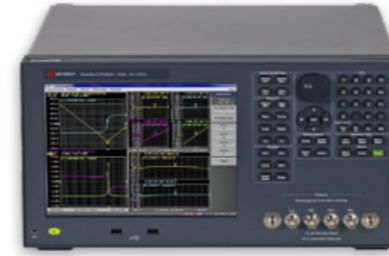
Keysight E4990A | Impedance Analyzer, 20 Hz to 120 MHz