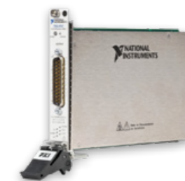
NI PXIe-4147 | PXI Source Measure Unit; 4-Channel, 8 V/3 A