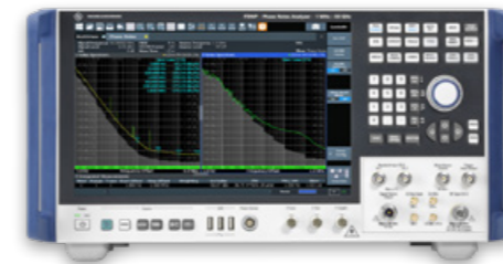
Rohde & Schwarz FSWP50 | Phase Noise Analyzer; 1 MHz to 50 GHz