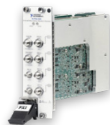
NI PXIe-5451 | PXI Waveform Generator; 2-Channel, 145 MHz