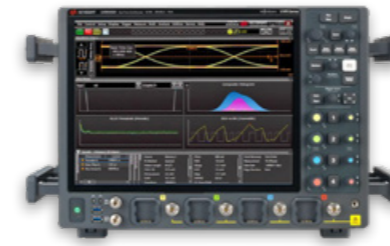
Keysight UXR0334B | Infiniium UXR Real-Time Oscilloscope; 4 Channels, 33 GHz