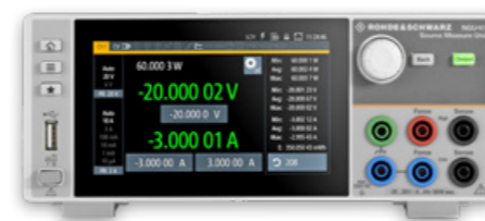
Rohde & Schwarz NGU411 | Four-Quadrant Source Measure Unit