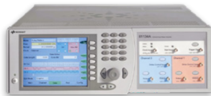
Keysight 81134A | Pulse Pattern Generator; 2-Channel, 3.35 GHz