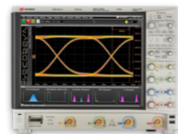
Keysight MSOS804A | Infiniium S-Series Digital Oscilloscope; 4-Channels, 8 GHz