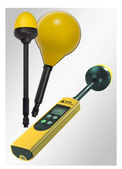
Changing the probe is quick and easy, with no need to reconfigure the device