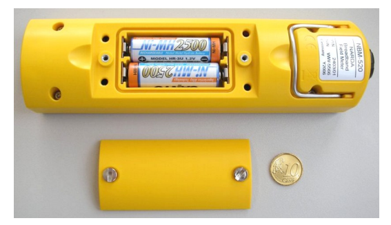
The battery compartment is opened easily using a coin. Two replaceable NiMH rechargeable batteries (AA size) are used to power the device.