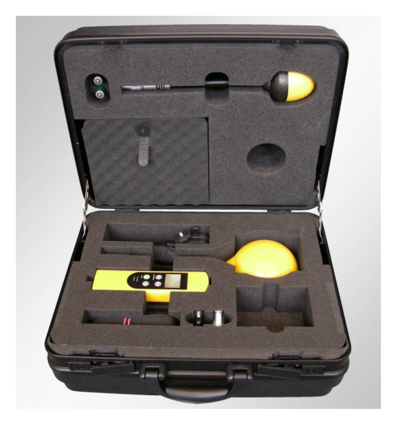
A rugged transport case is included. This provides ideal protection for the instrument, together with up to two probes and all accessories.