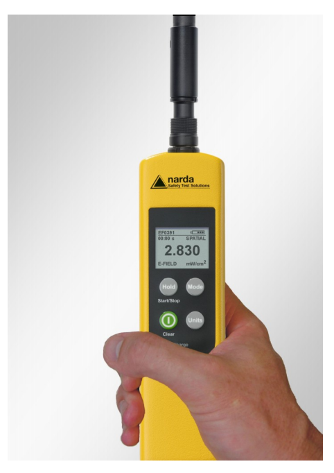
Small, lightweight and rugged design – ideal for use in rough environments

Suitable measuring probes for electric and magnetic field strengths are available for the frequency range from 100 kHz up to 90 GHz. So-called shaped probes which have frequency responses that weight the results according to specific human safety standards are available in addition to flat probes with flat frequency responses. All probes are calibrated independently from the measuring instrument. They include a non-volatile memory containing the probe parameters and calibration data, so they can be used with any instrument in the NBM-500 family.