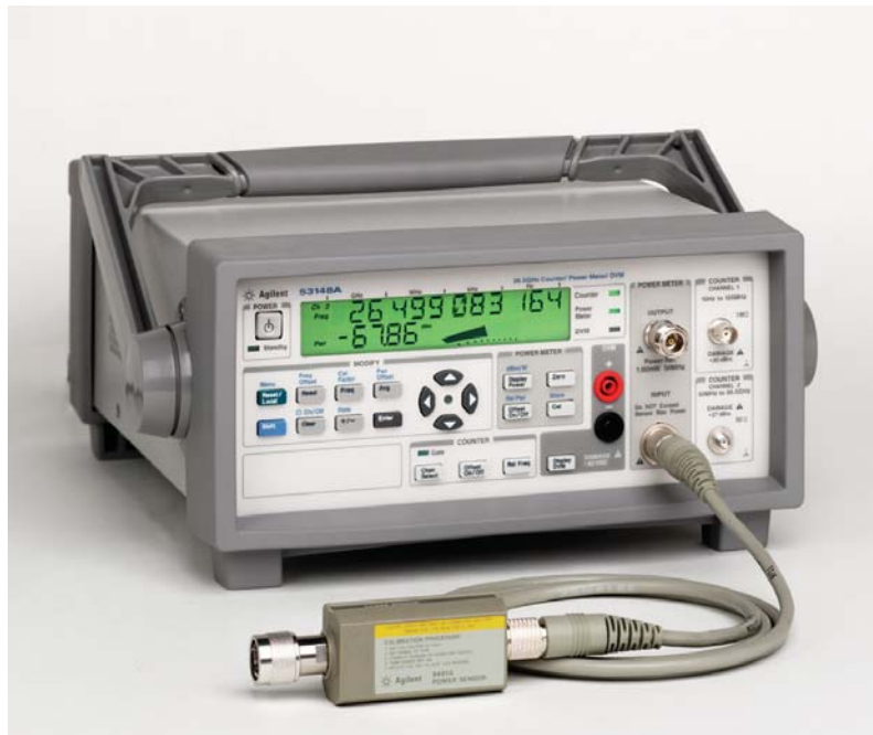
53140 Series microwave frequency Counter/Power meter/DVM

The Agilent 53140 Series includes full-featured 20 GHz/26.5 GHz/46 GHz continuous wave (CW) microwave frequency counter, a true power meter, and a dc DVM all in one small convenient package.