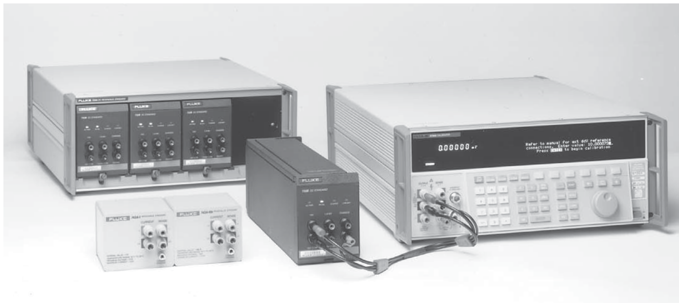
The 734A Reference and 732B Standards are a practical way to maintain and disseminate your volt and to support artifact calibration of instruments like the 5700A and 5720A Calibrators.

The primary benefits of maintaining your voltage reference at 10 V rather than 1.018 V center on efficiency and ease-of-use. At 10 V, you can intercompare standards directly with a digital voltmeter. The effects of noise and thermal EMFs are diminished by a factor of 10 compared to standard cells. And with 10 V Josephson Arrays becoming more common, working at the 10 V level further simplifies the process of establishing traceability. Finally, most modern dc instrumentation today requires a 10 V standard for calibration. When you ratio up to 10 V from 1.018 V, you lose considerable performance.