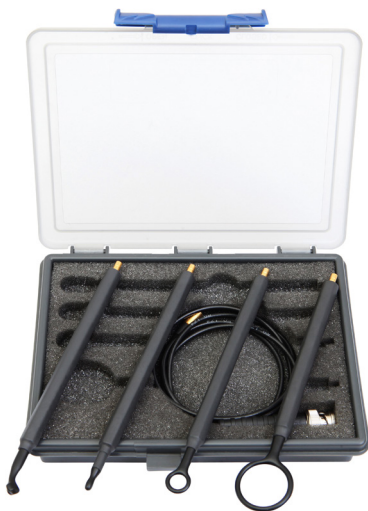
N9311X-100 (Near field probes)

Other calibration options may be available; for more information on calibration go to: www.keysight.com/find/calibration For more information on training and application support services go to: www.keysight.com/find/training