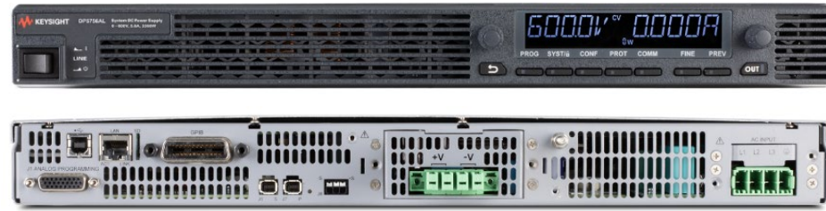
Figure 3. 3.4 kW model 1U full rack DP5700

Keysight enables innovators to push the boundaries of engineering by quickly solving design, emulation, and test challenges to create the best product experiences. Start your innovation journey at www.keysight.com .