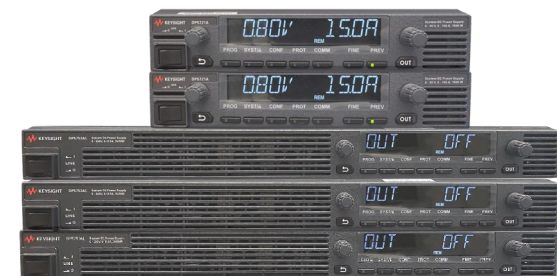
Figure 1. Upgrade your N5700 / N8700 to the new DP5700 for smaller, faster, and smarter power supply.