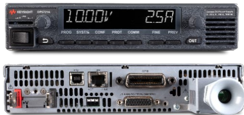
Figure 2. 1.5 kW model 1U 1/2 rack DP5700