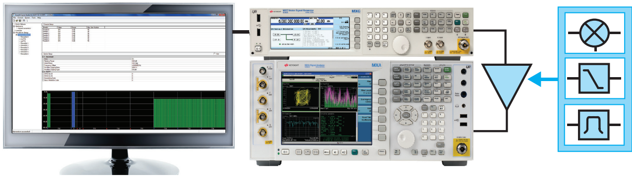
Figure 1. Typical component test configuration using Signal Studio's basic capabilities with a Keysight X-Series signal generator and an X-Series signal analyzer

Signal Studio's basic capabilities enable you to create and customize TD-SCDMA/HSPA signals to characterize the power and modulation performance of your components and transmitters on BTS and UE. Easy manipulation of a variety of signal parameters, including switching point, code domain power, and modulation type, simplifies signal creation.