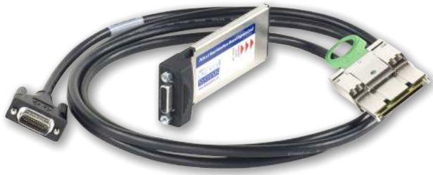
Figure 1. M9045B and Y1200B