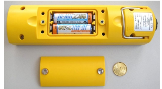
The battery compartment is opened easily using a coin. Two replaceable NiMH rechargeable batteries (AA size) are used to power the device.