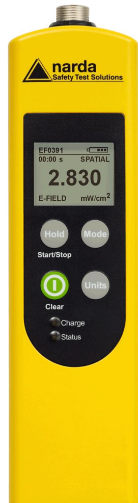
Narda Broadband Field Meter NBM-520

▲ Auto zero ensures precision measurements