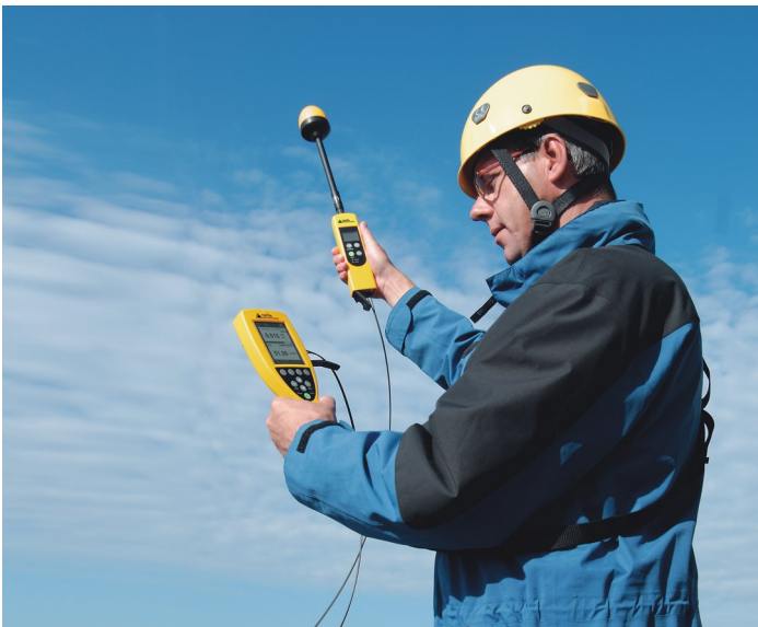
Probe extension using an optical cable: The NBM-550 acts as controller and displays the results. The smaller NBM-520 acts as the optical probe interface. Both devices can also be used separately as measuring devices when fitted with probes.