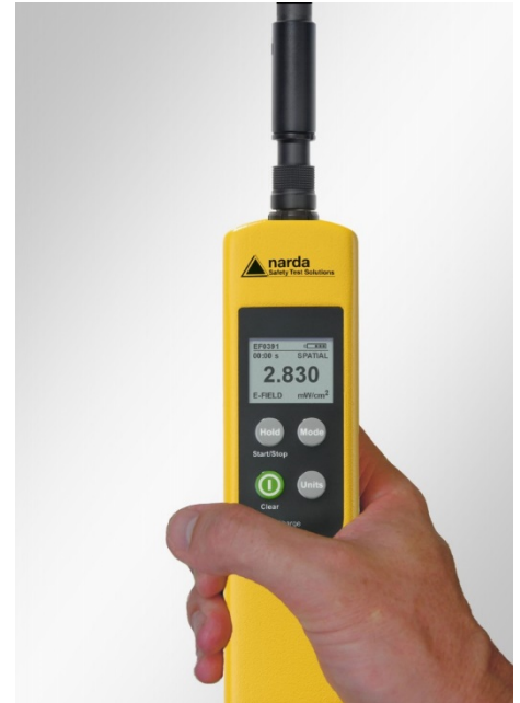
Small, lightweight and rugged design – ideal for use in rough environments