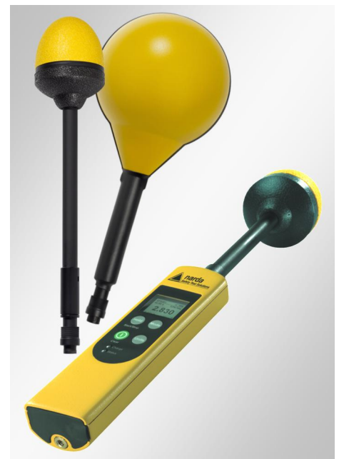
Changing the probe is quick and easy, with no need to reconfigure the device