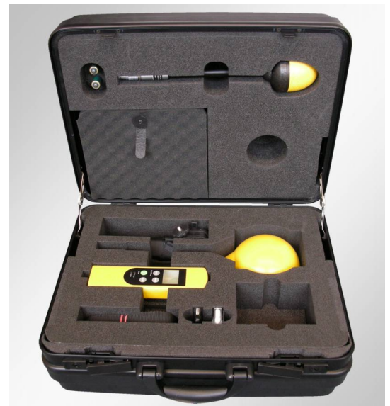
A rugged transport case is included. This provides ideal protection for the instrument, together with up to two probes and all accessories.