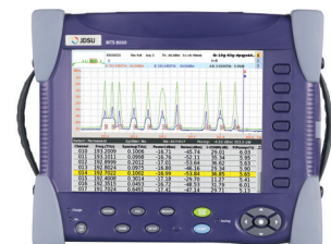
Scalable platform for multiple-layer and multiple-protocol testing