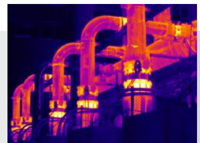
MultiSharp™ Focus, available on the Ti450.