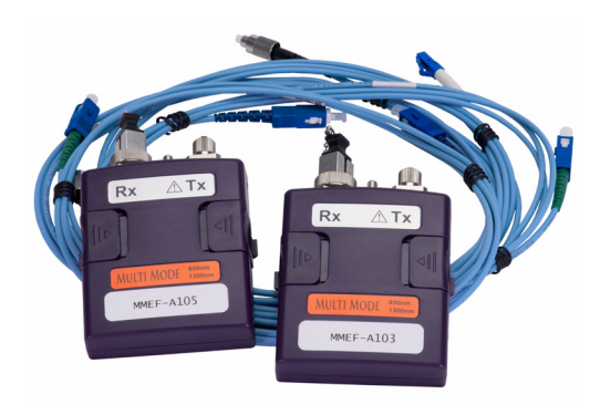
Multimode (encircled flux) modules

1. Append model number with -NA, -UK, -EU, -AU for regional power cords.