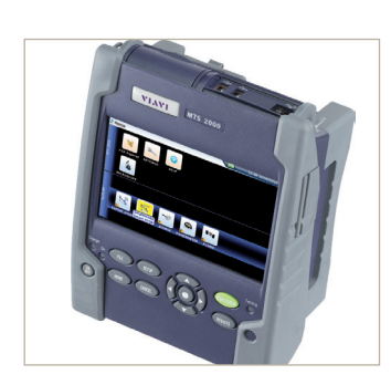
For more fiber testing and certification capabilities, combine the Certifier40G with one of the market-leading VIAVI fiber testers, such as the T-BERD/MTS-2000, OLTS-85P, and MPOLx.