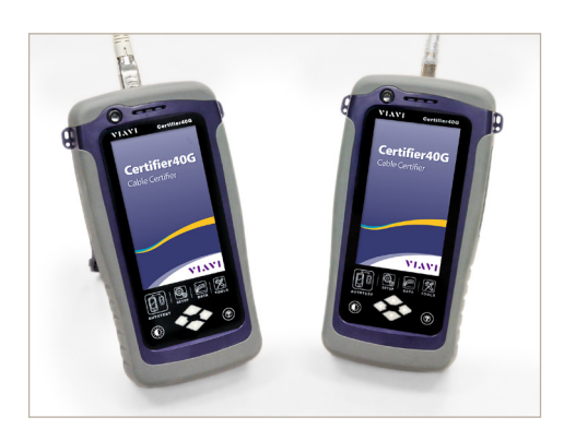
Two complete units minimize time initiating, naming, and saving results