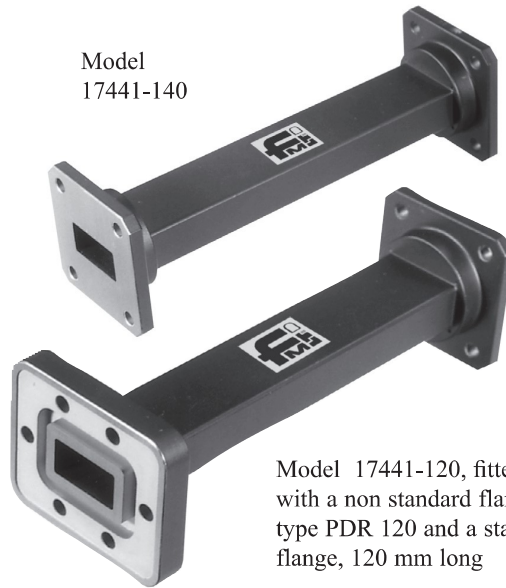
Model 17441-120, fitted with a non standard flange type PDR 120 and a standard flange, 120 mm long