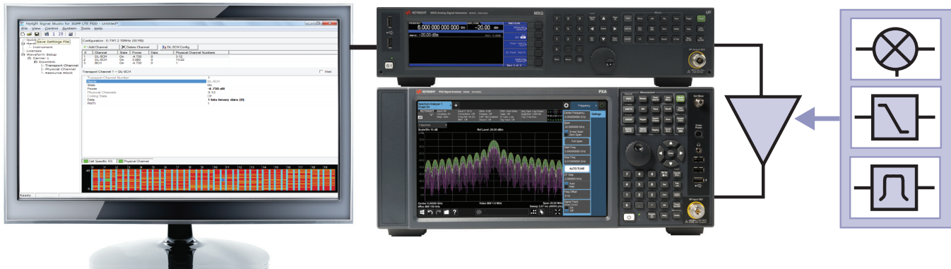
Figure 1. Typical component test configuration using Signal Studio's basic capabilities with a Keysight X-Series signal generator and an X-Series signal analyzer.

Signal Studio's basic capabilities enable you to create and customize a variety of WLAN 802.11 waveforms including 802.11a/b/g/j/p/n/ac/ah/ax to characterize the power and modulation performance of your transmitter or receiver components, such as amplifiers and IQ modulators. Easy manipulation of a variety of signal parameters, including standard format, transmission bandwidth, guard interval, data rate, and modulation type, simplifies signal creation.