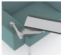
Tech Arm Only available on 8" Arms