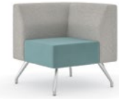
90° Corner Lounge