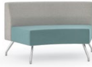
45° Crescent Lounge