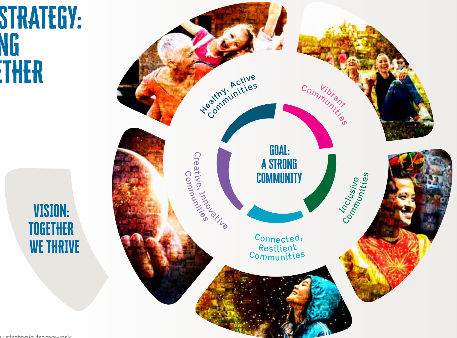
Chart 2: Sunshine Coast Community Strategy strategic framework