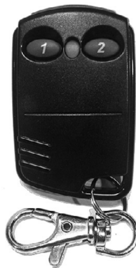
Figure 1: Pelican Waters North Lock wireless remote (FOB) note: both buttons will operate the lock

It comes with a two-year replacement guarantee. Council will cover the replacement of the FOB if the unit is found to be faulty during this time period.