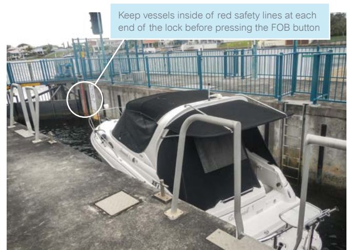
Figure 3: Keep vessels located centrally and between red safety lines