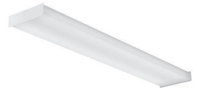
4' 120-277V 4000K SBL4 SERIES SQUARE-BASKET LED WRAPAROUND, WHITE