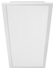
FIXT LED T-BAR 1X4 PANEL 4009LM 3500K/4000K/5000K 120V