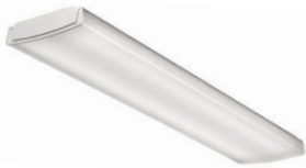
4FT 50W 120-277V 3500K LED WRAPAROUND, WHITE