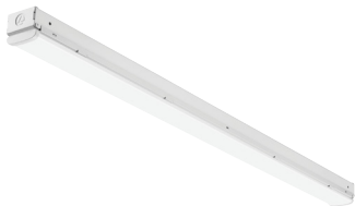
4000LM 5000K 120 V, CONTRACTOR, DIMMABLE, LED STRIP