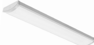
4FT 120V LED WRAPAROUND, 5000L, 3500K