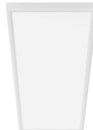
2X2 CPX LED FLAT PANEL, 3500K/4000K/5000K