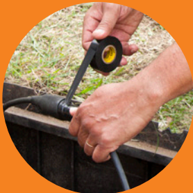
Moist and Corrosive Environments