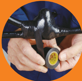
Excellent Stretch and Adhesion