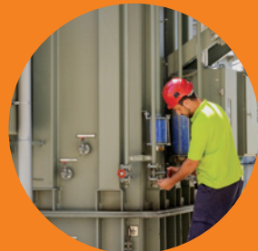
Medium to Industrial Use