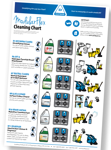
Custom Designed Wall Chart

Comes with a waterproof wall chart that explains the four dilution rates of chemicals installed in the system. The charts makes it easy for different users to benefit from the system.