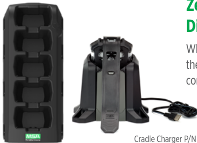
Cradle Charger P/N 10253408