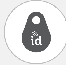
MSA id Tag