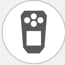
ALTAIR io 4