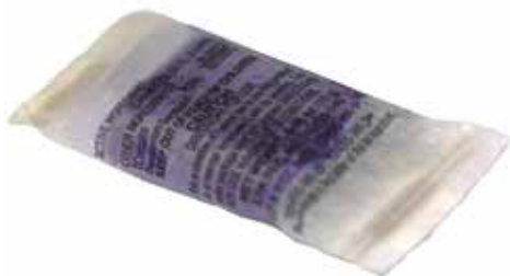
Photo may not be representative of a label-consistent bait placement