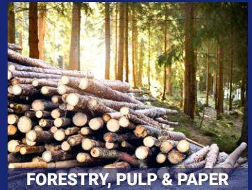
FORESTRY, PULP & PAPER