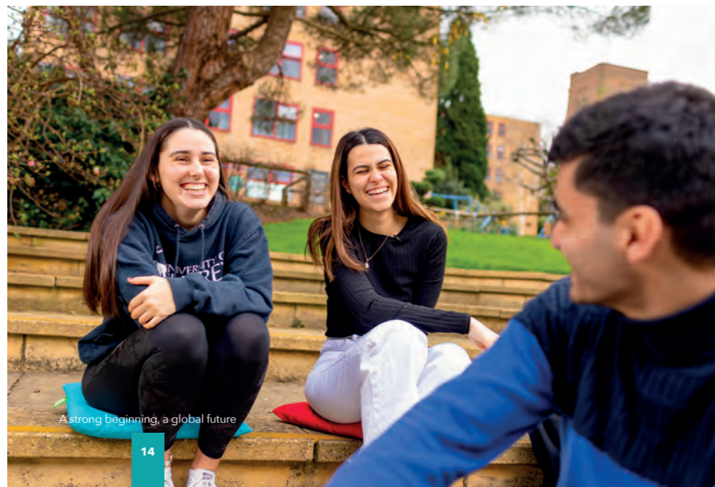
A strong beginning, a global future