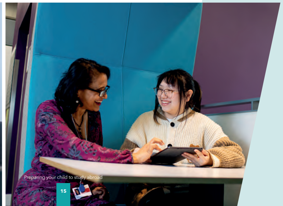
Preparing your child to study abroad