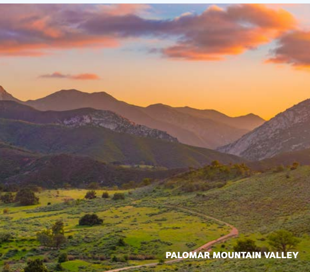
PALOMAR MOUNTAIN VALLEY