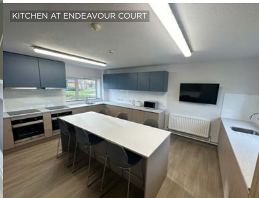
KITCHEN AT ENDEAVOUR COURT