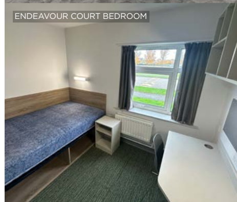
ENDEAVOUR COURT BEDROOM