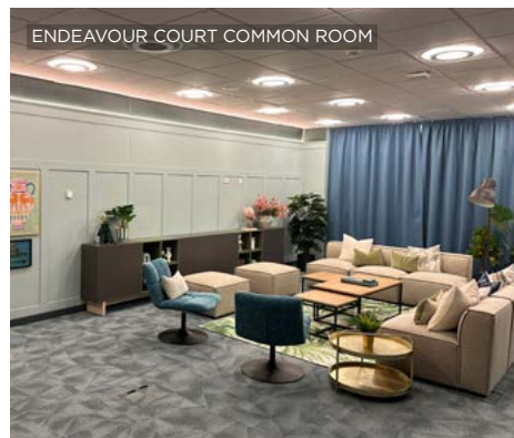
ENDEAVOUR COURT COMMON ROOM