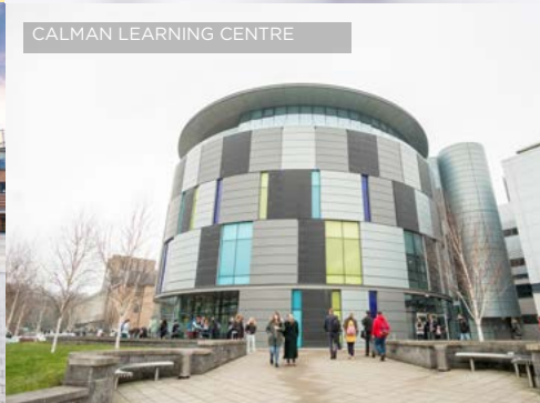
CALMAN LEARNING CENTRE