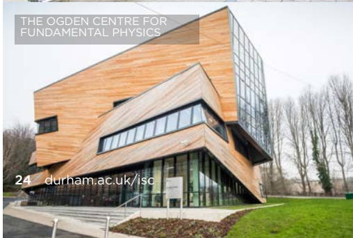
THE OGDEN CENTRE FOR FUNDAMENTAL PHYSICS