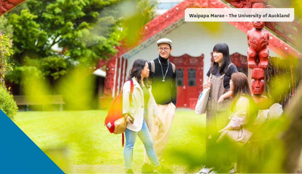
Waipapa Marae - The University of Auckland