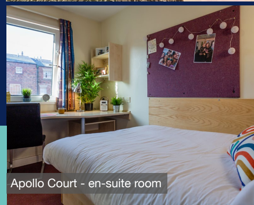
Apollo Court - en-suite room