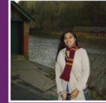
Peshall from India