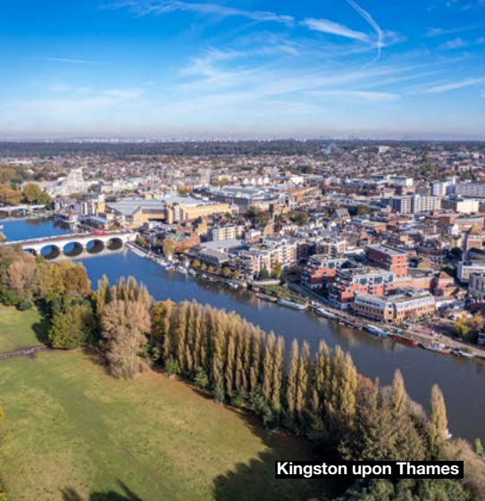
Kingston upon Thames