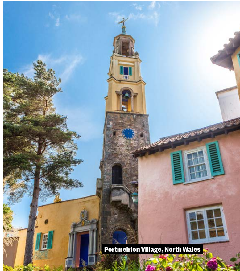
Portmeirion Village, North Wales

Despite having a reputation for being rainy, Wales' weather is very similar to the rest of the UK. The UK has four seasons and weather can vary considerably from month to month. The average temperature in Cardiff in winter is 7°C and in summer temperatures occasionally reach as high as 30°C.