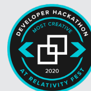
Virtual Helpdesk Development