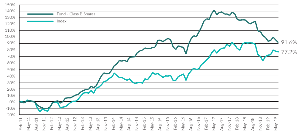
The graph shows the cumulative performance under Downing management (since Feb 2011)