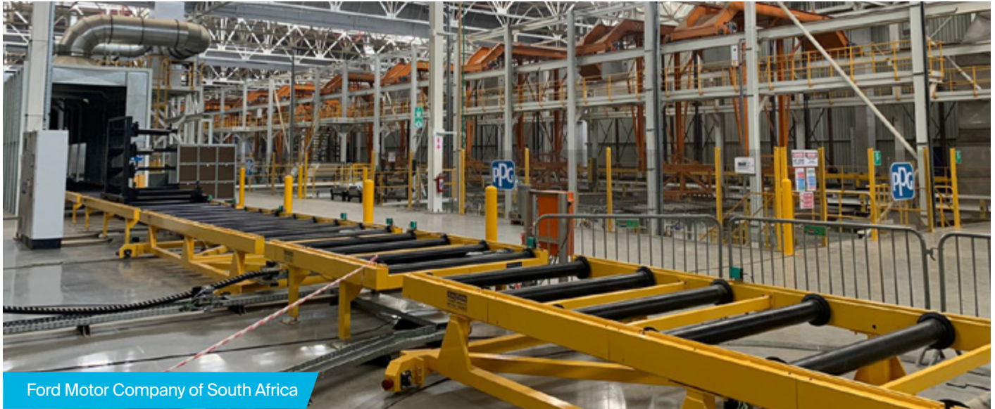
Ford Motor Company of South Africa

PPG also introduced low-temperature chemicals for the degreasing tanks, such as PPG ULTRAX 94D, a liquid alkaline cleaner developed for use in low-temperature cleaning. For the phosphate application on multi-metal substrates, PPG introduced Chemfos 700AW and 700RW.