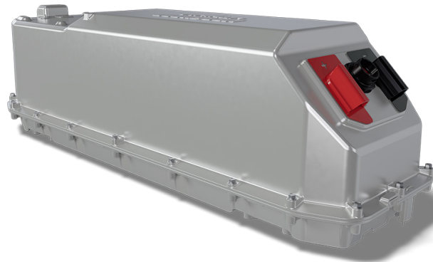
Battery Capacity Years in Service