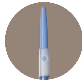
Smooth Rounded Tip of the OptiSite arterial cannula