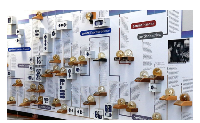
Edwards boasts the world's largest collection of mechanical and tissue heart valves

At our core, we believe there is enormous untapped possibility in medicine. We believe that together, we can change the way that medicine is practiced and therefore reduce the burden on patients. At Edwards, we are proving that many advances we could never have imagined before are possible.