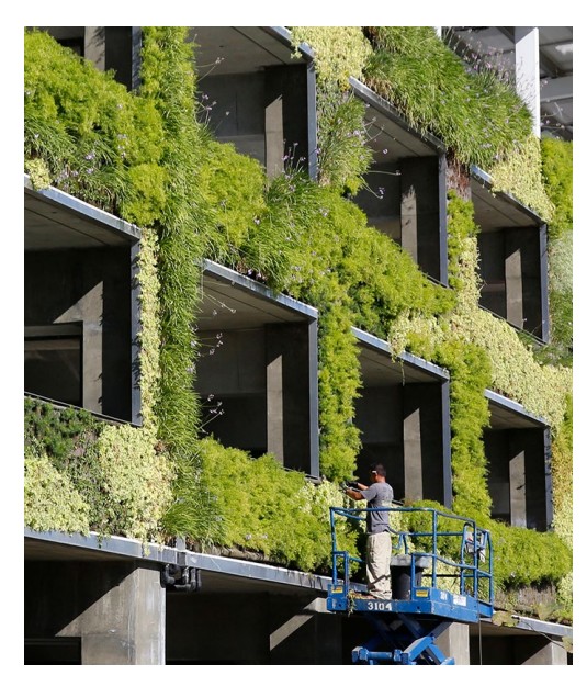
Edwards' Living Wall

We are committed to promoting environmental excellence in our operations and communities, and to providing a safe and healthy workplace for our employees. Achieving these goals requires more than just complying with applicable regulations in the regions where we operate and with medical device industry standards. It also includes embracing a responsible supply chain, maintaining a focus on product stewardship, implementing our own results-driven Environmental, Health, and Safety (EHS) programs, and respecting the EHS programs of our customers and stakeholders.