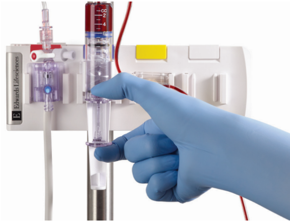
TruClip holder shown with VAMP closed blood sampling system.

The TruClip holder can be used to help reduce equipment clutter in the OR, ICU, ED and cardiac catheterization labs.