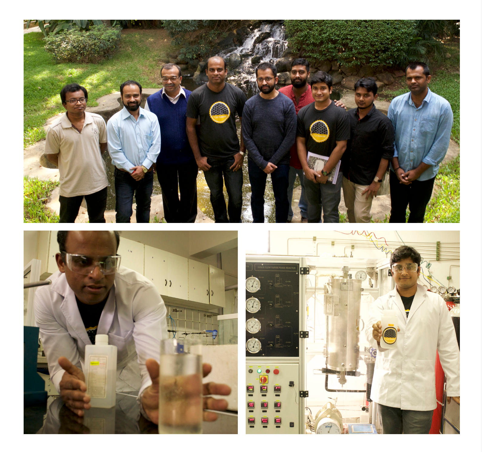
Breathe demonstrating their technology in Bangalore, India. December 2017