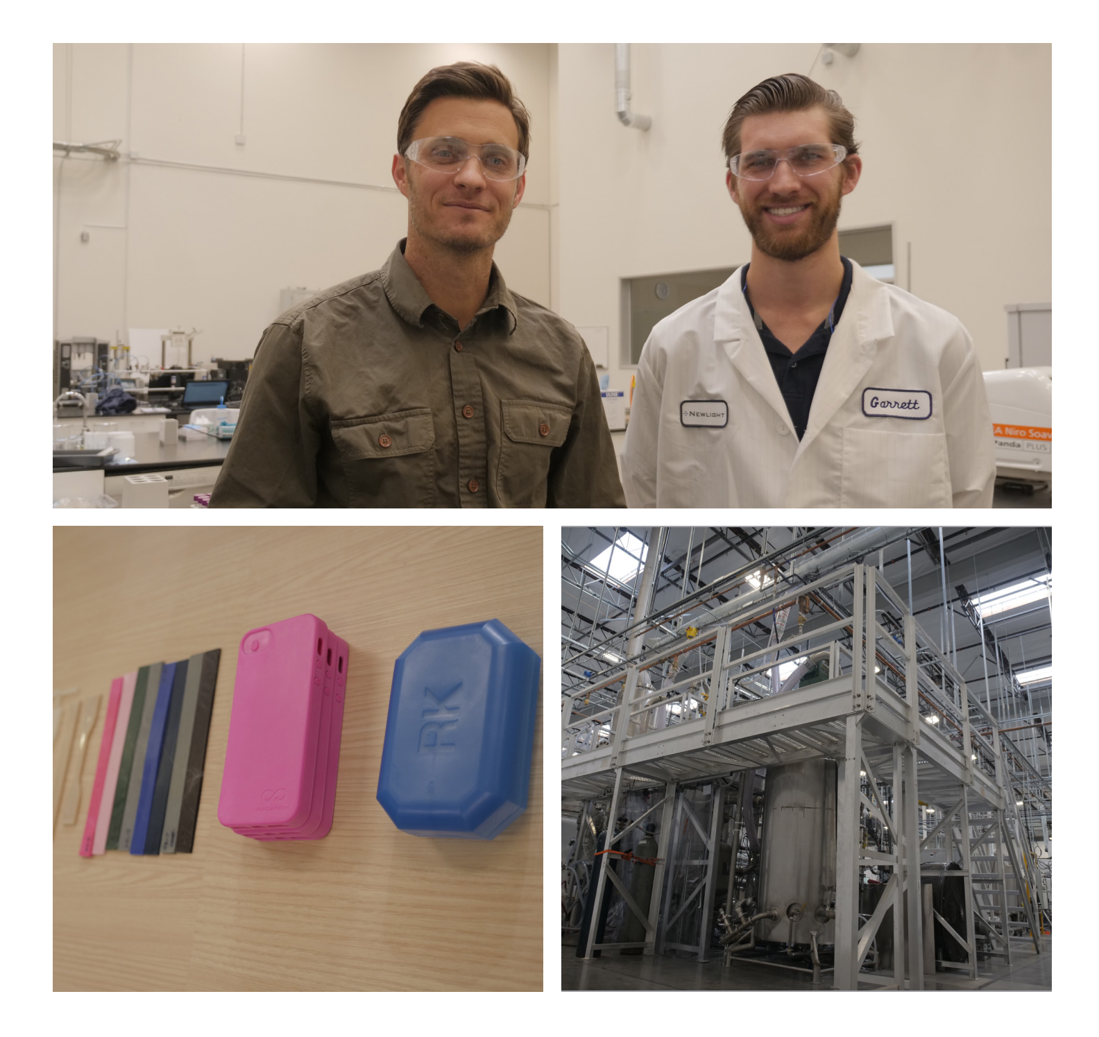
Newlight demonstrating their technology in Huntington Beach, USA. December 2017