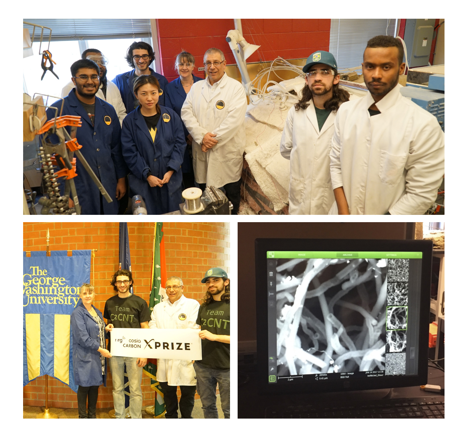
C2CNT demonstrating their technology in Ashburn, USA. November 2017