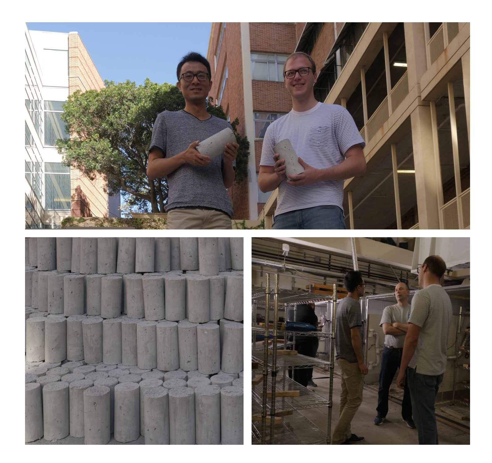
Carbon Upcycling UCLA demonstrating their technology in Los Angeles, USA. October 2017