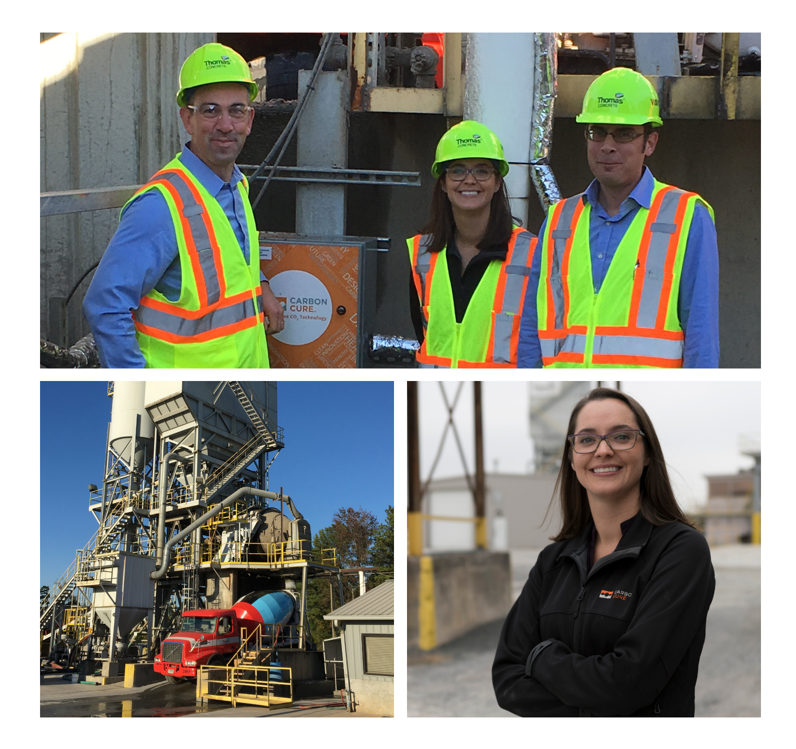
CarbonCure demonstrating their technology in Atlanta, USA. October 2017