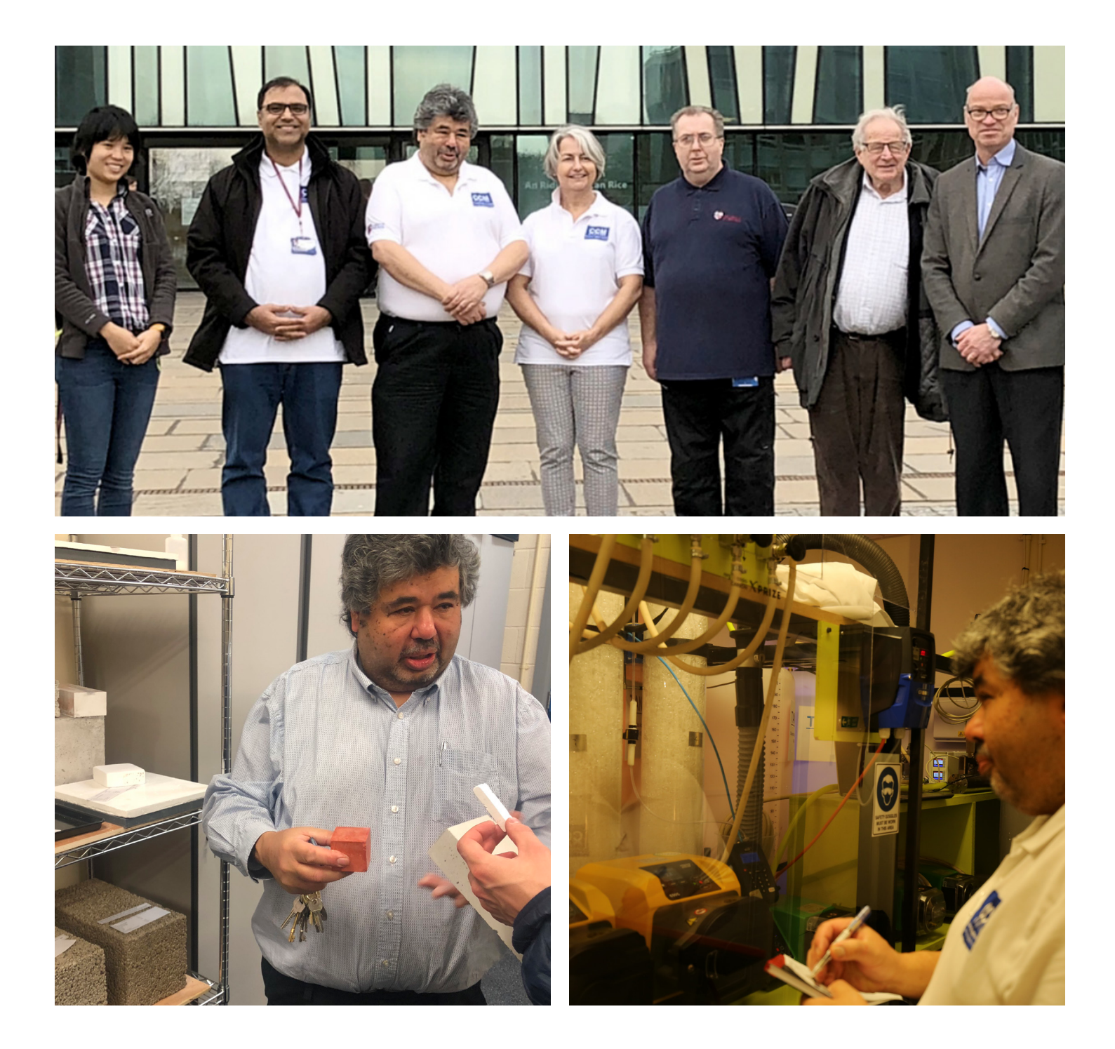
Carbon Capture Machine demonstrating their technology in Aberdeen, Scotland. December 2017