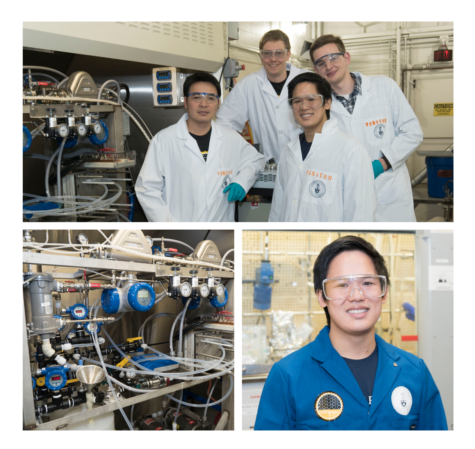
CERT demonstrating their technology in Toronto, Canada. December 2017