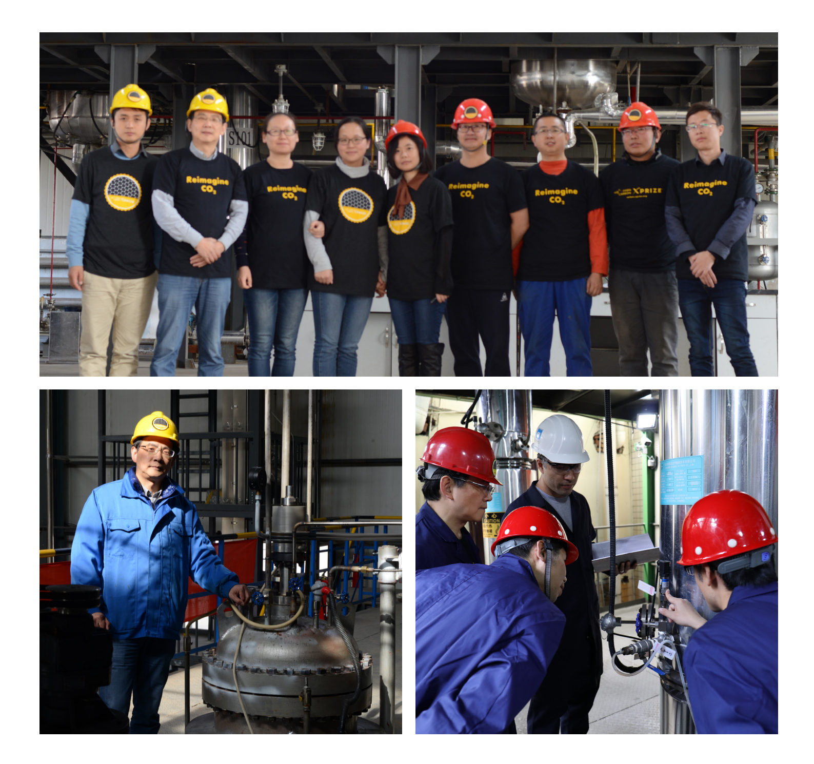
C4X demonstrating their technology in Suzhou, China. November 2017