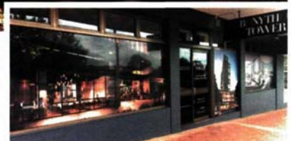
Bonython Tower Display Suite at 26 Adelaide Street, East Gosford