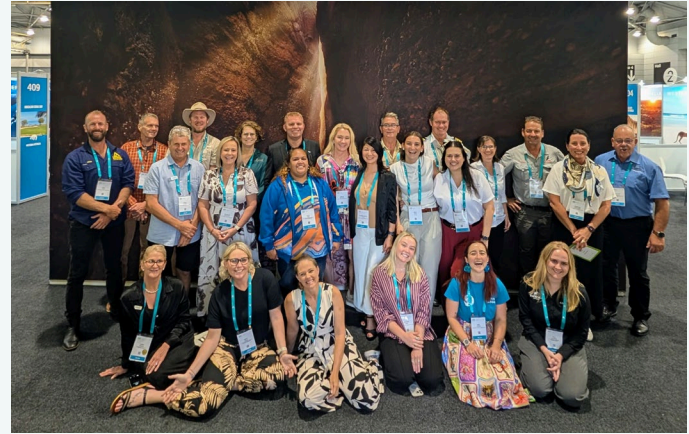
2025 TRIP Cohort at the Australian Tourism Exchange in Brisbane

“Attending ATE for the first time and being part of the TRIP program was such an incredible experience. The TRIP program made it more accessible and less daunting, and now that we’ve experienced it, we can see just how valuable it is for our business. We’ll definitely be attending ATE for many years to come.”