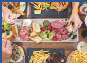
Breweries & Eateries