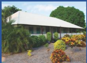
Museums of Broome

New Day Tour Visit our website for details