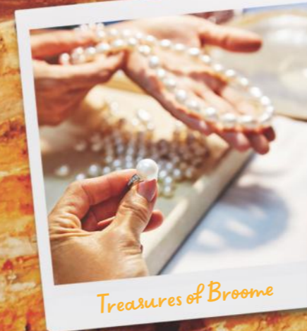
Treasures of Broome