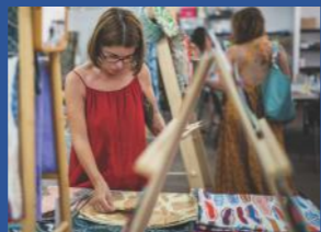
Art & Aboriginal Tours